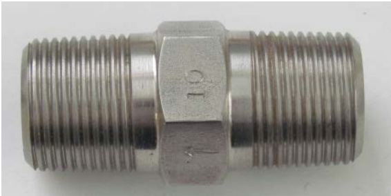
316 Stainless Ball Check 10 PSI ( \frac{1}{4} ", \frac{3}{8} ", \frac{1}{2} ", \frac{3}{4} ", 1")

316 Stainless Ball Check valve shown. The 316 Stainless 10 PSI O-Ring valve is identical in appearance except it is threaded to the hex nut part of the valve. The O-Ring valve comes in the same size orifices as the Ball Check valve and these sizes are approved for chemigation in Idaho.