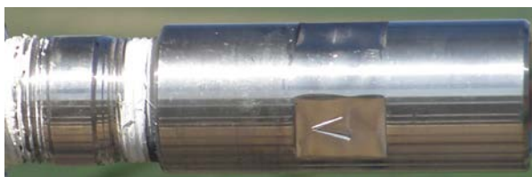
Stainless Check (3/4" new style)