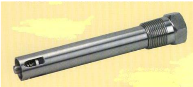
SSQ75 ( \frac{3}{4} ") & SSQ100 (1")