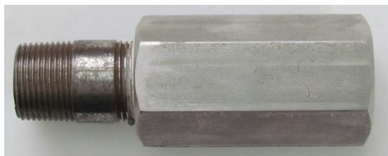
Stainless Check (1")