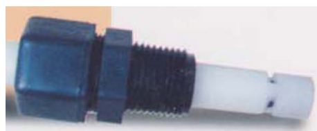
Mini Mist'r (1/4" & 1/2" thread)