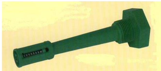
PPQ50 (resembles Mister Mist'r)