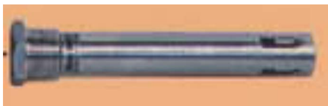
Mister Mist'r Stainless