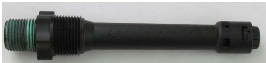
Mister Mist'r Ultra