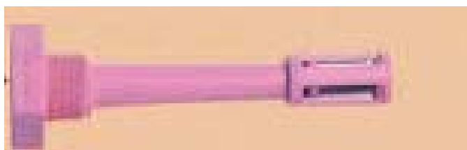
Mister Mist'r (colors vary)