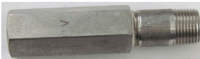
Stainless Check (3/4")