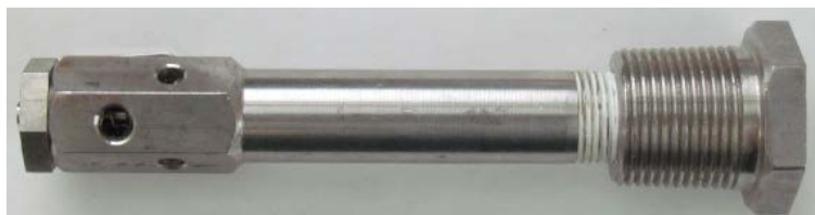
Max 94 (3/4" only)