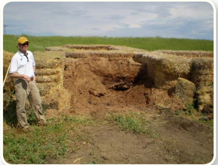
Bones remaining at 3 months, skull on left, spine on right. These will nearly breakdown completely when recovered for 3 more months

Size and volume of mortalities will directly influence the physical footprint of the pile or volume of bin space designed, amount of carbon material required, and the time required to fully compost the carcass(es). Smaller carcasses have more surface area relative to mass; this provides for more carbon material to carcass interaction. Similarly, cutting or breaking apart large carcasses can speed up the composting process, if necessary. While properly constructed and layered poultry mortality compost will process in a matter of a few short weeks, cattle will take months (6-12) under average conditions (in static piles; i.e., no turning).