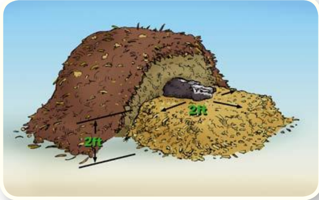
Cow position in pile

base will be about 9 feet wide by 10 feet long. Once the mortality is placed in the middle of the base, 24 inches of cover in all directions should be attained. Considering side slope, material on top will likely be more than 24 inches above the mortality to achieve the proper margin. When layering smaller carcasses, or parts of carcasses, an 8 to 12 inch margin should be maintained around each carcass. Bins and bunkers can reduce height and foot print of piles.