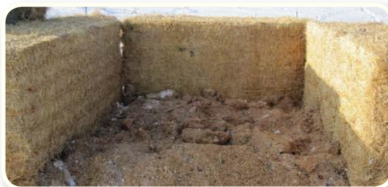
Bin and base