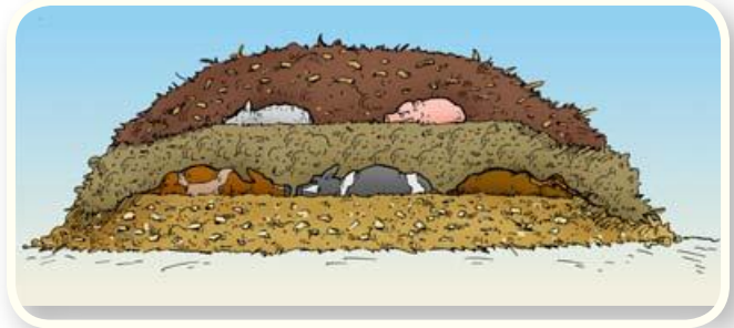
Layered small carcasses

of 18-24 inches, as illustrated below. Estimates of total material needed to fully compost a full grown cow are 12 cubic yards, or for 1,000 lbs of carcass, 7.4 cubic yards (200 ft 3 ). The difference in the estimates can be attributed to the thicker base recommended by some experts. Practically speaking, for a mature cow, a proper