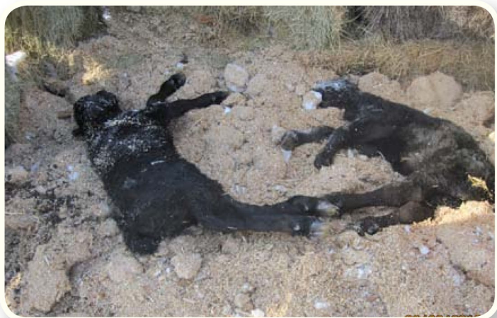
Calves on base

should be covered completely with material on all sides (as described in the next section). The finished pile may reach up to six feet in height, in the example of a large cow. Small carcasses should be layered and arranged to maintain carbon margins around each dead animal. Small carcasses can also be stacked in tiers with carbon layers in between.