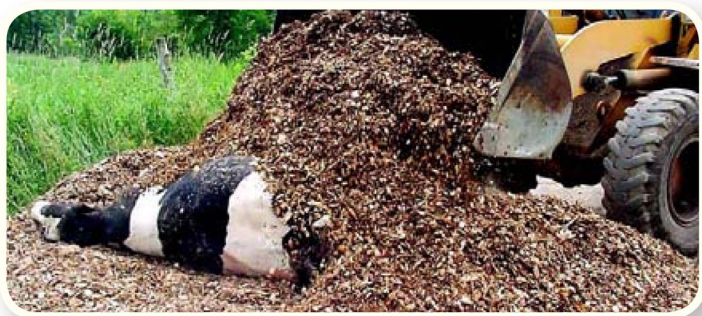
Cows on base, credit: TX A&M Agrilife Extension