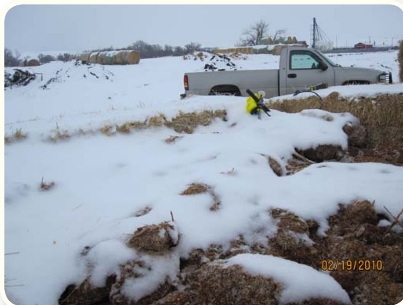
Snow on pile/bin

While much of the northern plains and Rocky Mountains are dry for most of the year, there are periods when moisture can become excessive. Excess moisture is not so much an issue with the piles themselves but with traffic lanes and carbon sources. Carbon sources should be properly stored or covered if precipitation could saturate them. Carbon sources in the previously mentioned 40-60 percent moisture range are very ideal for mortality composting and continue to absorb moisture, preventing leaching. Excessively dry compost piles will actually shed water for a time before they begin to absorb moisture. Snow does not seem to affect the pile and may serve as an insulating blanket during periods of extreme cold. Bad weather, of course, can increase mortality and base piles should be constructed ahead of time in expectation of weather-related deaths.