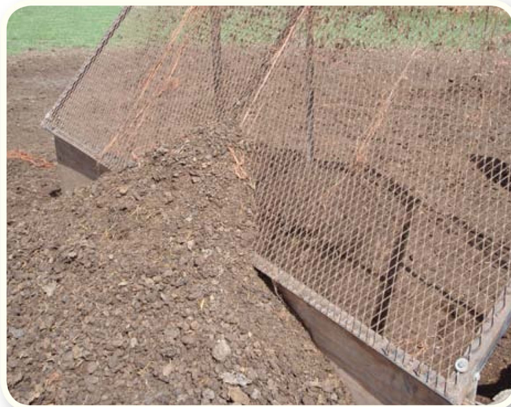
Home-made screen

A screen is also helpful in improving final product quality, especially if the compost will be land applied. A screen allows for the separation of compost fines from residual bones and other trash such as baling twine, ear tags or other material. The simplest screen, ideal to have near the mortality compost site, is a frame of angle iron with an expanded metal face. The face should be angled at 45 degrees or more, and elevated one to five feet off of grade with the top of the screen appropriate to the reach of the loader being used. The width should also be relative to the width of the bucket on the operation's loader. For example, screen area should be five to six feet wide by six to eight feet long, angled and elevated as previously described. More discussion of bones and screening is found in the Issues section of this document.