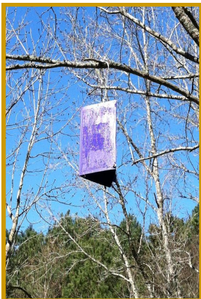
EAB Purple Prism Trap

Each summer, traps attractive to adult EAB are set up in various locations throughout the state. Since the areas containing traps are very limited, you can help by becoming familiar with the appearance of the beetle and reporting any possible sightings of the pest. If you can collect a specimen or get a good digital photograph that would aid greatly in confirming identification.