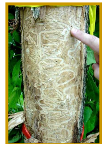
Emerald Ash Borer "S" shaped larval feeding tunnels