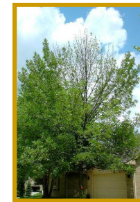
Root and stem suckers below Emerald Ash Borer dieback.