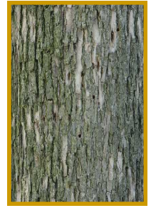
Emerald Ash Borer "D" shaped exit holes