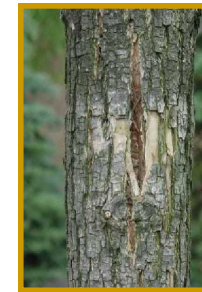
Split bark over an Emerald Ash Borer larval gallery

Infestation by EAB can be difficult to detect until tree canopy die-back occurs—usually the upper third of a tree will thin and die back. This is followed by a large number of shoots or branches arising below the dead portions of the trunk. Other signs of infestation include D-shaped exit holes on branches and the trunk. Tissue produced by the tree in response to larval feeding may also cause vertical splits to occur in the bark. Distinct S-shaped larval feeding tunnels may also be apparent if bark is stripped back.