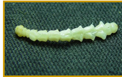
Emerald Ash Borer Larva

EAB adults are dark metallic green in color, 1/2 inch in length and 1/16 inch wide. They are present only from mid May to late July, during which time a female will lay 40 - 200 eggs.