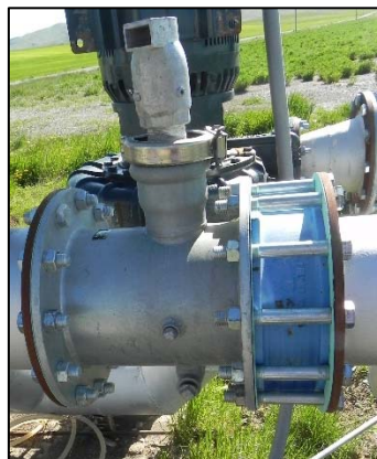
Wafer Check Valve and Spool